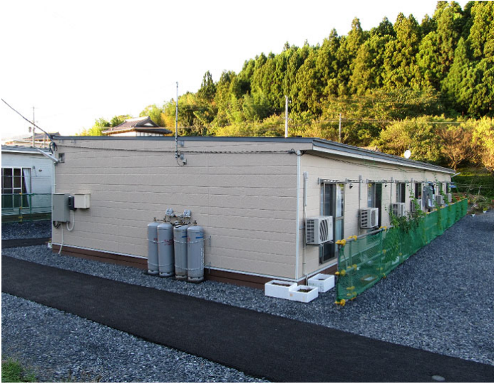
Temporary housing in an isolated area of Iwate prefecture.

The scant reconstruction that has begun is the replacing of walls on the few structures that had a frame strong enough to withstand the tsunami. That said, the government has done a commendable job of building temporary housing, commonly two-room units that provide privacy and are well-equipped. However, the temporary housing is often located in isolated areas away from shops, medical facilities or food stores. Those who have been directed to leave the evacuation centers and move into the temporary housing must forgo free meals and are expected to pay for utilities and services, a tough obligation for victims who lost their place of employment due to the tsunami. Furthermore, most of the temporary housing will be available only for a two-year period, which will create a new challenge to assist victims' transition to more permanent resettlement.