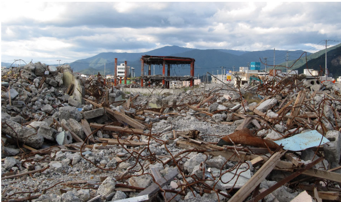
City of Ofunato.

Seeing the devastated areas in person, even six months after the disaster, gave me an entirely different perspective. Full recovery will take up to a decade. The nuclear radiation crisis in Fukushima will take many decades. While tremendous progress has been made in the cleanup effort, only 60% to 70% of the debris has been cleared and very little has been disposed of. Two-story high fields of debris, separated into massive piles of concrete, metal, wood and plastics, cover what little open space remains. Destroyed automobiles and large appliances also wait to be cleared. Japanese media reports there are more than 25 million tons of debris to be cleaned up; it is hoped to have all debris cleared by next March and completely disposed of by March 2014.