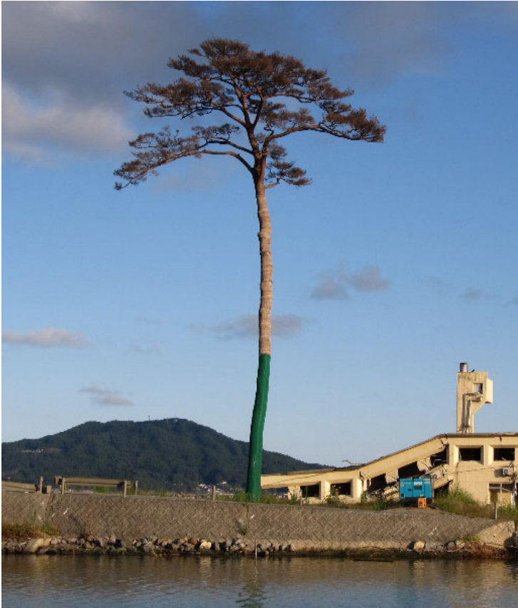
Tree of Hope — the single surviving tree from a forest of over 7,000 pine trees swept away by the tsunami in the city of Rikuzen Takata.

Back home now, I harbor a new understanding and perspective on how Japan's triple disasters have changed everything on so many different levels, and I am even more thankful now for the many things we often take for granted. I look forward to visiting Tohoku again and I encourage everyone to continue to support Japan as it works to overcome the many challenges of recovering and rebuilding after one of its worst disasters in history.