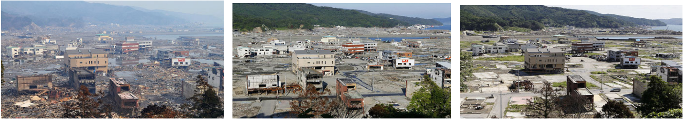
Photo caption provided by AP/Kyodo News: "This combination image, the initial destruction and progress of cleanup after the March 11, 2011 earthquake and tsunami is seen in Otsuchicho, Iwate prefecture, northern Japan. The top photo, taken March 14, 2011 shows buildings standing amid the debris. The middle photo, taken June 3, 2011 and the bottom photo, taken Sept. 7 show the cleanup and demolition are still in progress. AP/Kyodo News"

Two weeks prior to my trip, the Japanese media distributed a large number of combination photos showing three scenes (shown above): the first scene was during and/or just after the tsunami hit, the next photo was the same scene three months later and finally, a photo of how the scene looked at six months. The international media published these photos that show debris cleaned up and damaged roads repaired. However, after visiting the devastated areas, it is clear that such photos give a false impression that recovery and rebuilding is well underway.