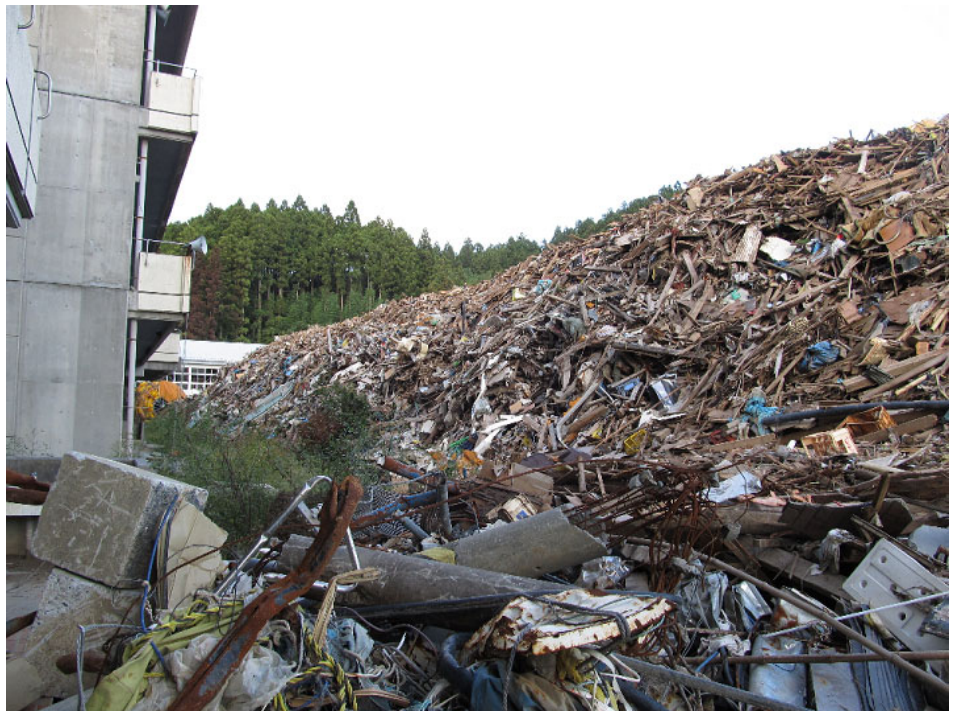
Ofunato's Akazaki Elementary School's playground is now claimed by a massive pile of wood debris.

While there are physical signs of progress, one of the large concerns is the psychological impact on the victims who have lost loved ones, friends, homes, important heirlooms and irreplaceable burial sites of their ancestors. Moreover, the disruption to children's lives has both immediate and long-term impacts on their wellbeing. For children relocated or those forced to stay indoors due to the radiation threat, being "locked" inside and not being able to play or go outside has added to their stress. Most open spaces, including parks, playgrounds and school yards, have been claimed by the cleared piles of debris or temporary housing, thus severely limiting the places to have fun and "just be a kid." Families living near the crippled Fukushima Daiichi nuclear power plant have an added level of anxiety due to worries about their health and the health of their children, both born and unborn. It is not widely reported, but the suicide rate in the affected areas of Tohoku has been rising each month since the earthquake. These psychological affects and how to address them are being examined by local and national governments, as well as the many non-profit organizations operating in the devastated areas.