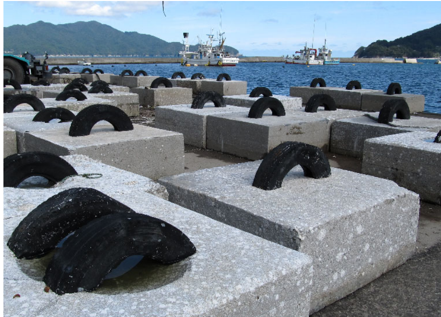
The tiny (Population: 100) fishing village of Koishi Hama, Iwate prefecture, lost all but four of its 60 family-owned fishing boats. To survive economically, the village is using its remaining boats to "farm" scallops by using nets that will be anchored to these large, newly created blocks of cement.

profit organizations and their volunteers operating in fields previously led by government agencies. They commend the Japan America Society of Southern California for our quick response, as well as the $22 million in relief and recovery funds raised by the all the Japan America societies within the National Association of Japan-America Societies' network. Furthermore, they thank the world for its heartfelt and unprecedented outpouring of support for Japan.